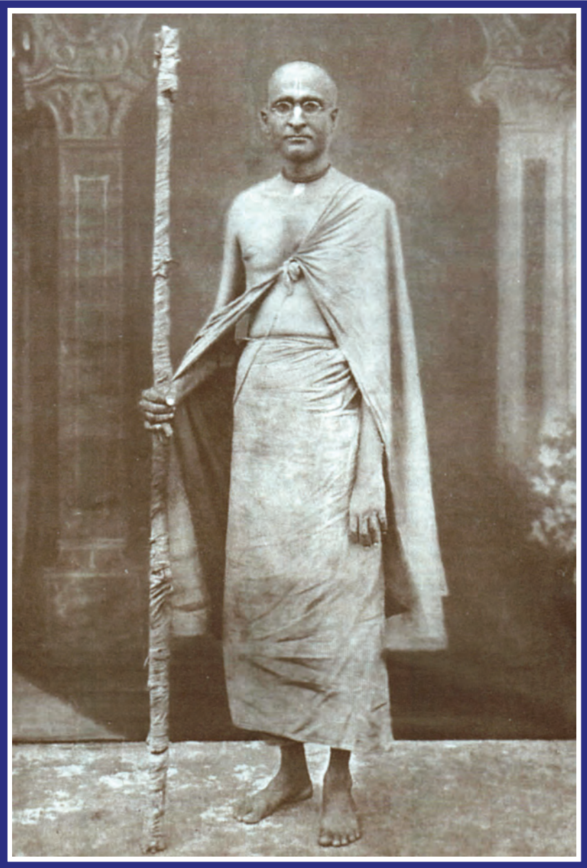
nitya-līlā-praviṣṭa om viṣṇupāda ŚRĪ ŚRĪMAD BHAKTISIDDHĀNTA SARASVATĪ PRABHUPĀDA