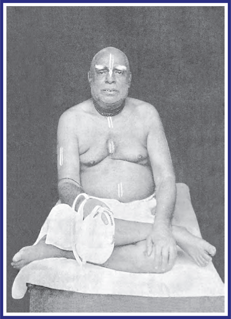
ŚRĪLA BHAKTIVINODA ṬHĀKURA