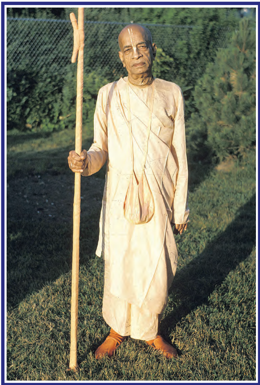
nitya-līlā-praviṣṭa om viṣṇupāda ŚRĪ ŚRĪMAD BHAKTIVEDĀNTA SVĀMĪ MAHĀRĀJA